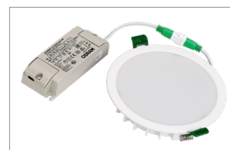
REMOTE MOUNTED OSRAM DRIVER