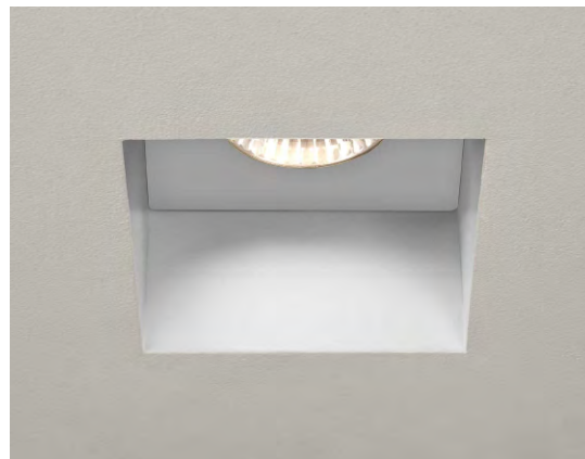
CODE: 1248005 (5670) FINISH: MATT WHITE

TO MAINTAIN THIS PRODUCT TO ITS BEST CONDITION, PLEASE VIEW OUR CARE AND CLEANING GUIDE ON THE SUPPORT SECTION OF THE ASTRO WEBSITE.