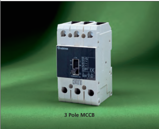
3 Pole MCCB