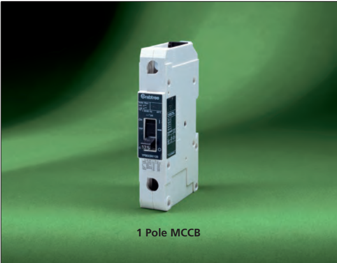
1 Pole MCCB