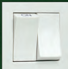
Wide concave rockers are easy to operate.

The range of socket outlets, fused connection units and switches is complemented by products which cater for specific applications such as cooker control units, shaver units, fan control switches and shower control switches.