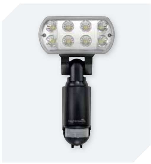
NIGHTHAWK Low Energy LED Security Light