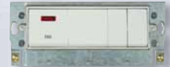
Example of yoke furnished with modules