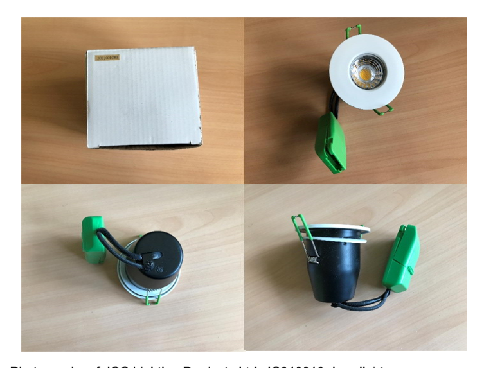
Figure 1: Photographs of JCC Lighting Products Ltd, JC010010 downlight.