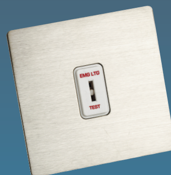
86C + I KEL W