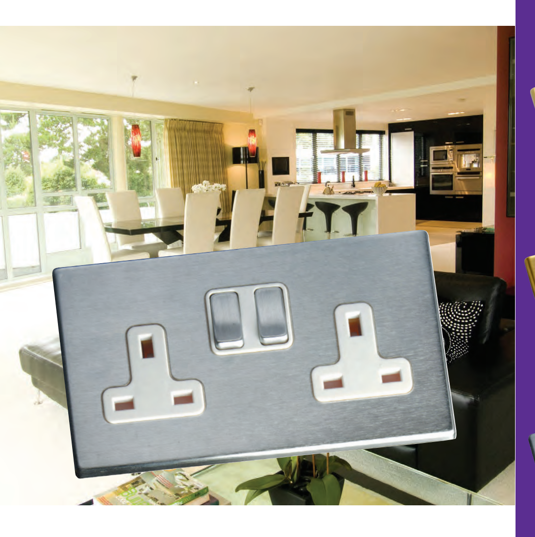
Hamilton Hartland CFX° Concealed Fixing