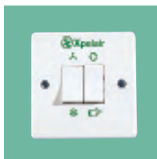
Manual Override Switch MOS Ref. 90199AW