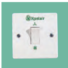
Change Over Switch COS Ref. 90108AW