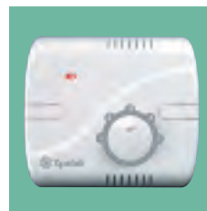
Time delay unit DT20B Ref. 21850AW