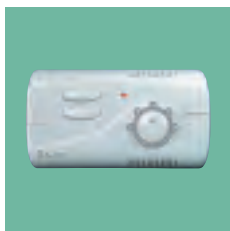
Remote Humidistat XRH Ref. 21856AW