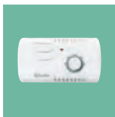
Air Quality Sensor AQS Ref. 92097AW