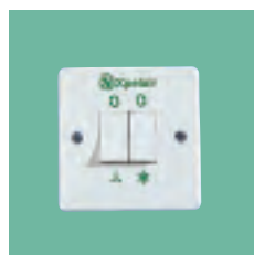
Timer and Boost Switch TBS Ref. 90202AW