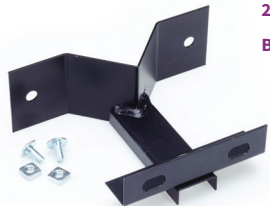
Swivel wall bracket, 270° movement, black BTHB3A