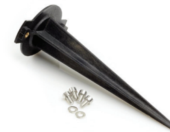
Large spike I2000B