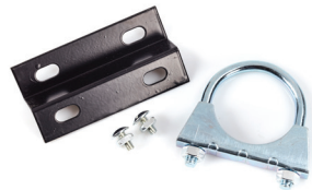
Scaffold Bar BTHB9A