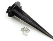
Small spike I1000B