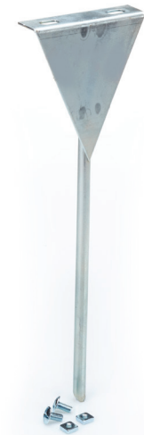
Zinc coated spike BTHB5A