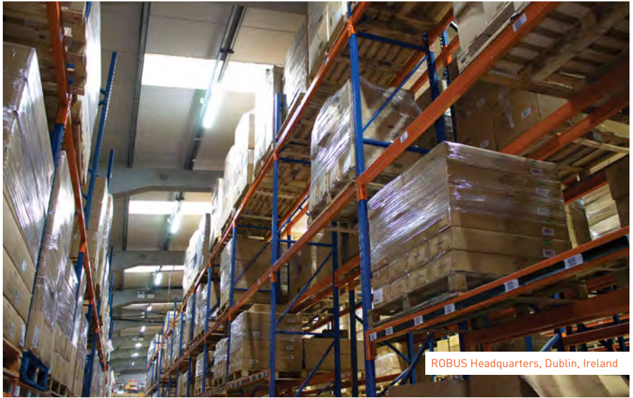
ROBUS Headquarters, Dublin, Ireland