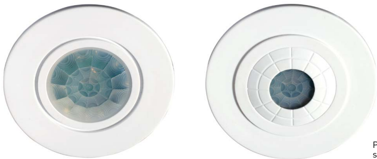
Proton 360° with shield accessory