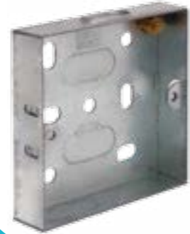
Dry Lining Boxes