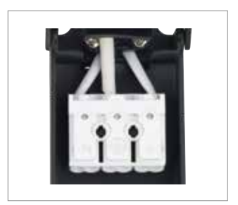
Connector with push fit loop in/loop out terminals suitable for use with solid or stranded cable