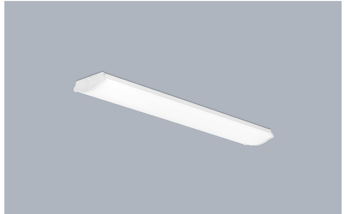
PrincetonPRO™ 1200mm 20W LED Linear