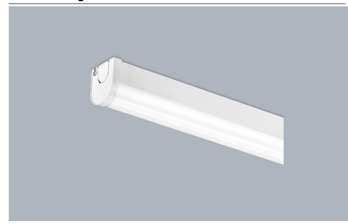
BatPac™ PRO 1800mm 73W LED Batten