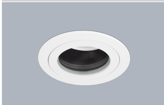
EDLM™ PRO Fixed Black Baffled IP65 Downlight