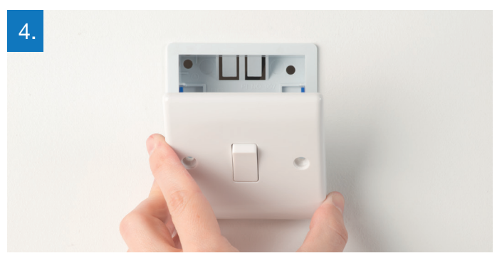
Gently ease the socket from the mounting box to show the wiring.

At the consumer unit, find the trip switch which protects the circuit and turn it all the way off. The indicator window should stay green.