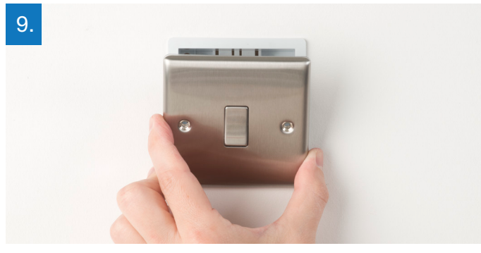
Gently press the socket back into place over the mounting box. Take care not to trap any wires between the wall and the socket.

Place the brown wire (live) into the COM terminal, the switched live wire (blue/brown stripe) into the L1 terminal and the green/yellow wire (earth) into the separate earth terminal on the face plate.