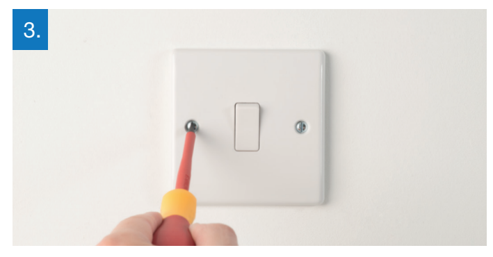
Test power is not supplied to the socket by using a plug in socket tester or multimeter. Unscrew the retaining screws on the socket so that it is released from the mounting box.

To start, make sure you are familiar with the safety warnings in this leaflet, the instructions supplied with the product and the mains supply is turned off.