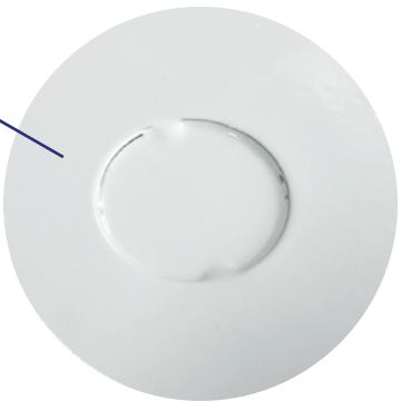
Hole knockouts on each side of fitting