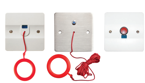
HARK<sup>™</sup> Pull cord units and Push Button Option Available in Stainless steel or white polycarbonate

The Overdoor indicator/Sounder unit is supplied with an integral Power supply unit. A fused spur should be fitted nearby and wired to this unit to provide power. The unit will illuminate and sound as soon as a call is activated. The unit will cease once the reset switch is pressed.