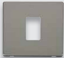
SCP401 SMART1 Cover Plate