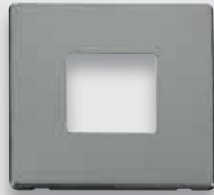
SCP402 SMART2 Cover Plate