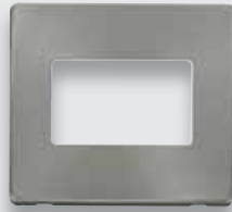
SCP403 SMART3 Cover Plate