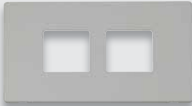
SCP404 SMART4 Cover Plate