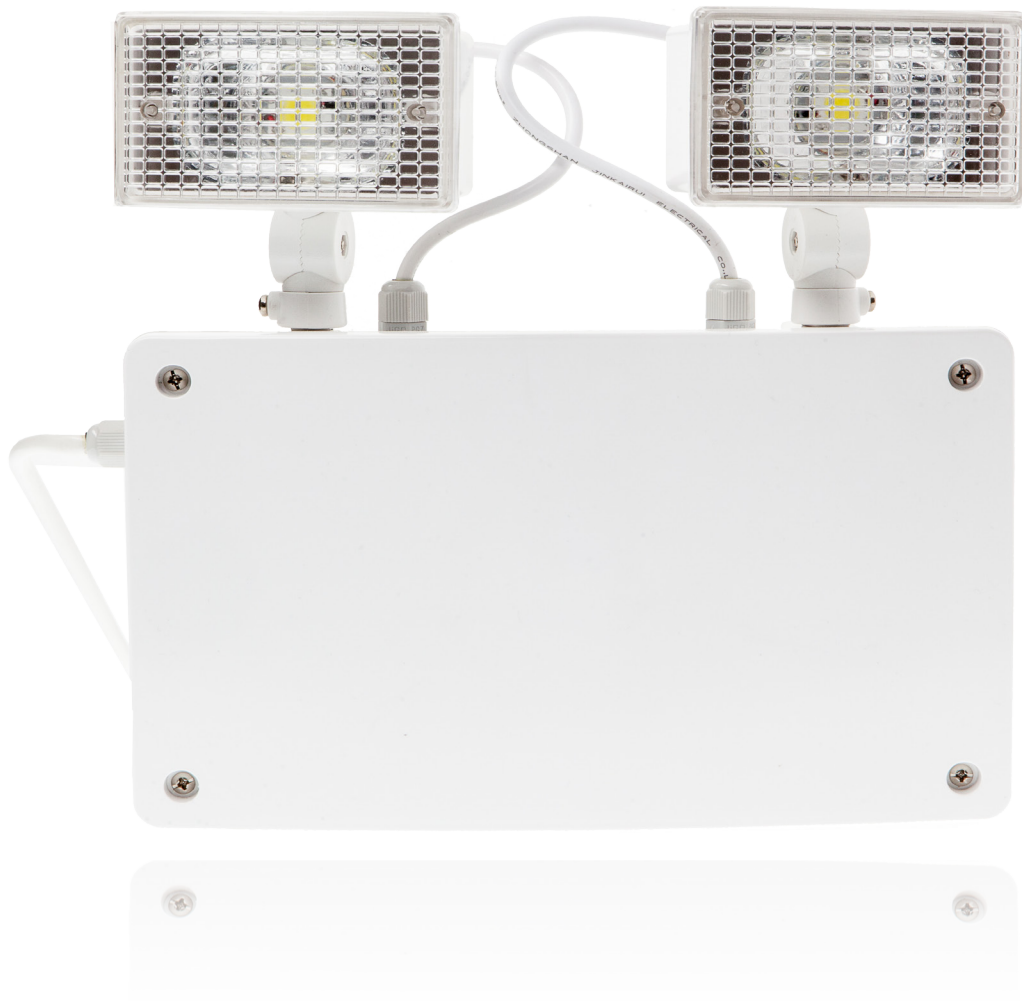
LED Twin Spot from Channel Safety Systems