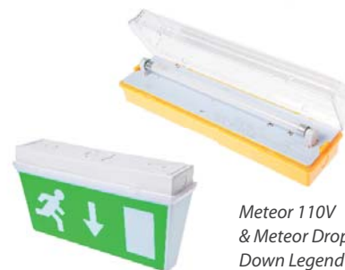
Meteor 110V & Meteor Drop Down Legend