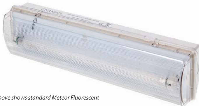
Image above shows standard Meteor Fluorescent