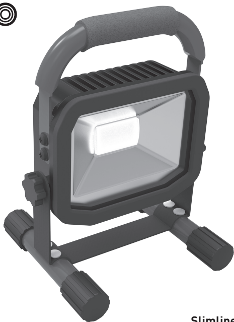
Slimline Portable Work Light