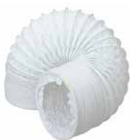
Ø100mm EasyPipe 100