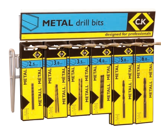
Metal drill bits, metric -Top sellers display

CONTENTS: 8 x drill bits, twin pack, sizes: 3 & 3.5mm. 6 x drill bits, twin pack, sizes: 2.5 & 4mm. 8 x drill bits, size: 5mm. 3 x drill bits, size: 6mm.