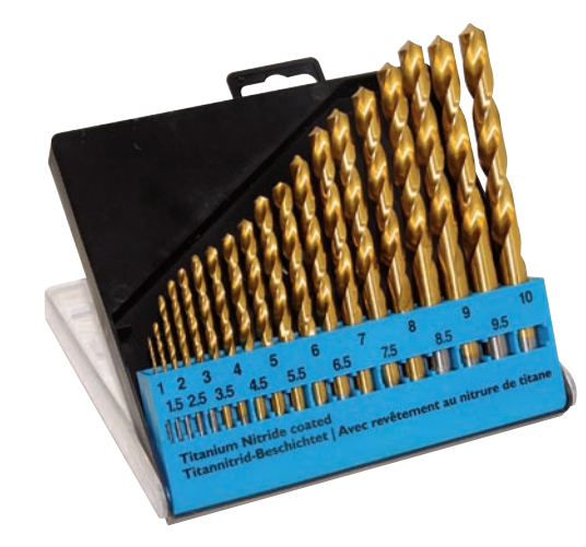
Metal drill bits TiN coated set -19 Piece

CONTENTS: 1 x drill bit, sizes: 1, 1.5, 2, 2.5, 3, 3.5, 4, 4.5, 5, 5.5, 6, 6.5, 7, 7.5, 8, 8.5, 9, 9.5 & 10mm.