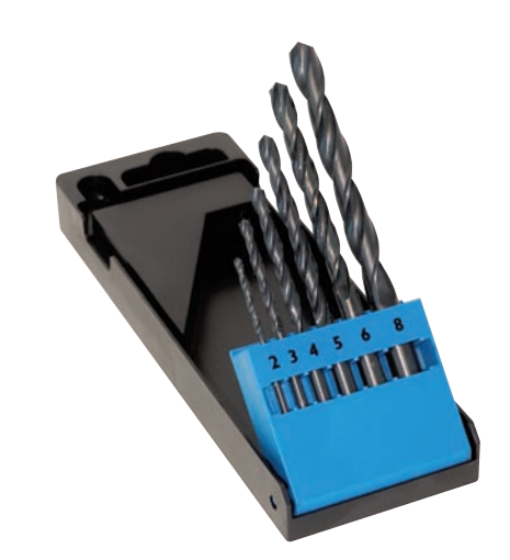
Metal drill bits set -