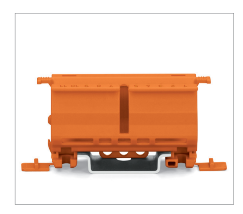
222-500 Mounting Carrier