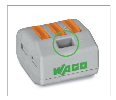
Test slot Back of the housing