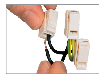
Strip both conductors - 11mm. Insert the solid conductor fully into the installation side to complete the connection.