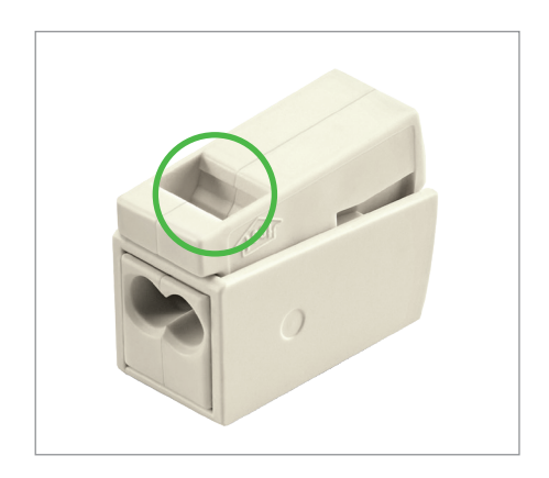
Test slot Back of the housing