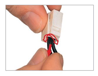
4. To remove the installation side simply twist and pull the conductor at the same time. To remove the lighting side squeeze together the housing and pull out the conductor.