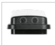
PIR mode selector settings for daylight and time