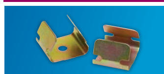
FIRE PERFORMANCE CLIP

If self adhesive format is required, please replace the FTS prefix with FSA.