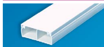
TWIN COMPARTMENT MINI TRUNKING White - Standardised in 3m lengths