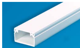
MINI TRUNKING White - Standardised in 3m lengths