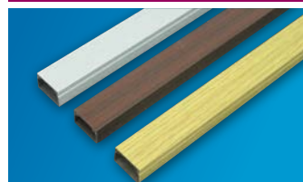
MINI TRUNKING FOILED EFFECTS Available in 2 and 3m lengths