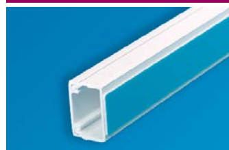
SELF ADHESIVE MINI TRUNKING White - Standardised in 3m lengths