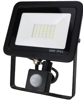
Image shown FLAC30BPIR