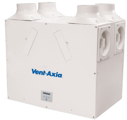
Lo-Carbon Sentinel Kinetic Plus

Vent-Axia's Lo-Carbon Sentinel Kinetic Plus creating the perfect home environment