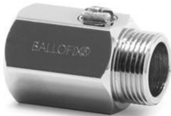
MxF Chrome Screw Driver Slot