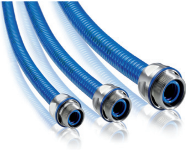
PMA's JFBD conduit is available by itself or combined with Pflitsch blueglobe CLEAN® Plus cable glands in nominal widths of 12, 17, 23, 29, 36 and 48.

This new innovative manufacturing technology includes a second production stage which overextrudes a smooth, extremely easy-to-clean coating onto the conduit. The coating meets the FDA's CFR 21 / EU 10/2011 standards (up to 65°C). This innovative combination, consisting of the easy-to-clean surface and the well-proven, highly-flexible, mechanically durable conduit, satisfies the food industry's high requirements in the most effective way.