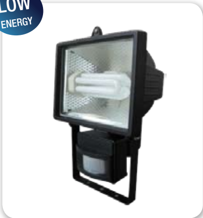
24W Energy Saving Floodlight PIR

Item No. OE-24WFLOOD-PIR Material. Aluminium Die-Cast Body PIR Sensor, 24W R7s Lamp, IP44