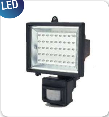
3W Super Bright LED Floodlight PIR

Item No. OE-LED-PIRFLOOD Material. Aluminium Die-Cast Body PIR Sensor, Runs Cool, Bright, Low Energy, 45pcs LED, 3W, IP54