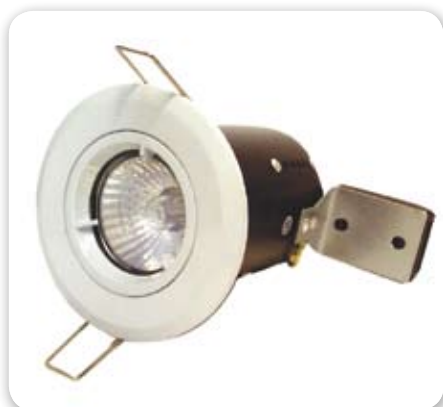
Tested to 30, 60 and 90 minutes

The Contractor+ Range offers excellent quality and the only choice where cost reduction is essential