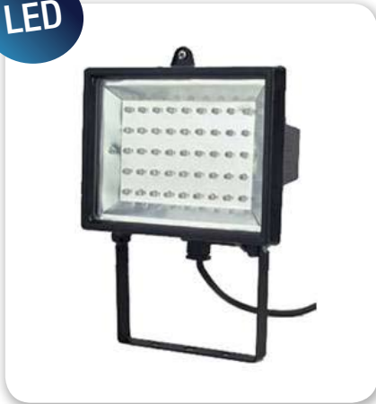
3W Super Bright LED Floodlight

Item No. OE-LED-FLOOD Material. Aluminium Die-Cast Body Runs Cool, Bright, Low Energy , 45pcs LED, 3W, IP54