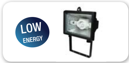
9W Energy Saving Floodlight

Item No. OE-9WFLOOD Material. Aluminium Die-Cast Body, 9W R7s Lamp, IP44