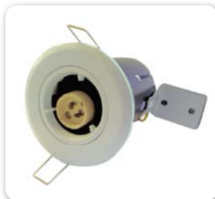
Available in Chrome, Brushed Chrome or White