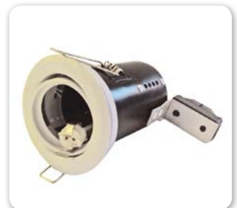
Accepts all lamps from halogen to CFL and LED