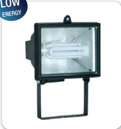
24W Energy Saving Floodlight

Item No. OE-24WFLOOD Material. Aluminium Die-Cast Body, 24W R7s Lamp, IP44