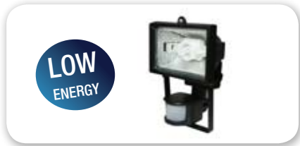
9W Energy Saving Floodlight PIR

Item No. OE-9WFLOOD-PIR Material. Aluminium Die-Cast Body PIR Sensor, 9W R7s Lamp, IP44