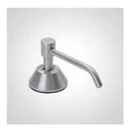
BC628SS DOLPHIN COUNTER MOUNTED SOAP DISPENSER

60 MM HEIGHT ABOVE COUNTER 250 MM HEIGHT BELOW COUNTER