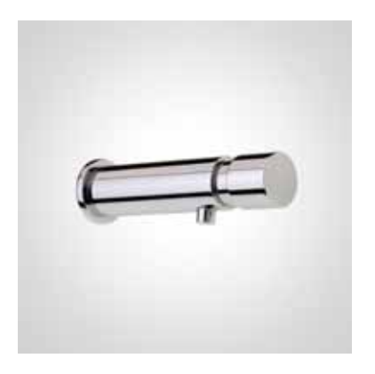
BC194 DOLPHIN PANEL MOUNTED SOAP DISPENSER