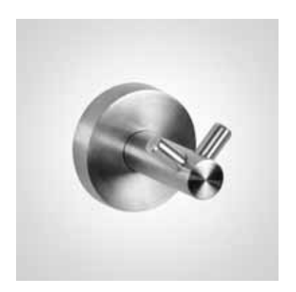
BC726 DOLPHIN DOUBLE ROBE HOOK