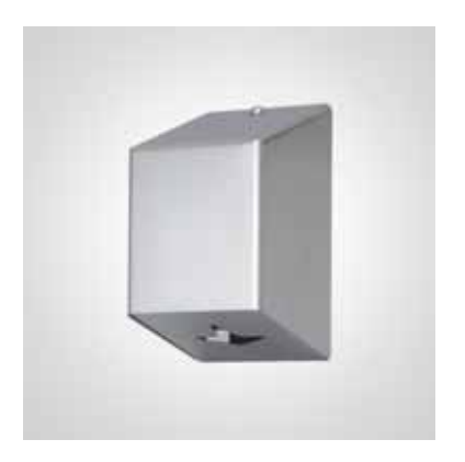
BC8312 DOLPHIN STAINLESS STEEL STANDARD CENTRE-FEED DISPENSER

370 MM HEIGHT 210 MM WIDTH 218 MM PROJECTION