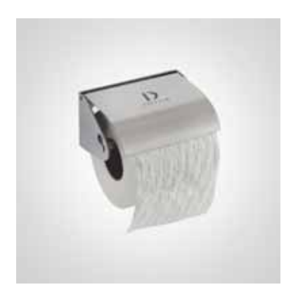
BC266 DOLPHIN STAINLESS STEEL TOILET ROLL HOLDER

70 MM HEIGHT 135 MM WIDTH 98 MM PROJECTION