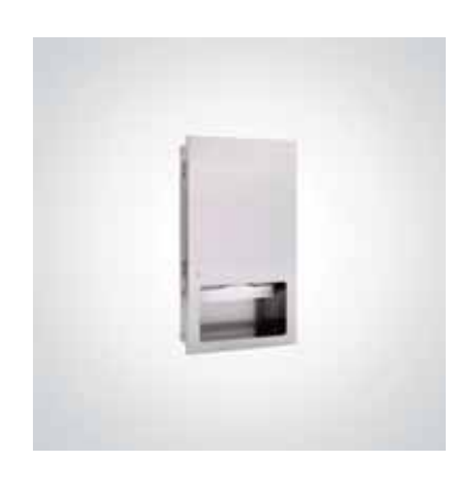
BC27-3SCA DOLPHIN RECESSED PAPER TOWEL DISPENSER

579 MM HEIGHT 320 MM WIDTH 16 MM PROJECTION