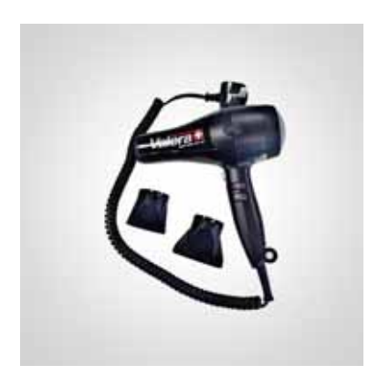
BC109-ST5 DOLPHIN VALERA HAIR DRYER