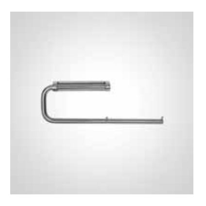
BC271-2 DOLPHIN STAINLESS STEEL TOILET ROLL HOLDER

93 MM HEIGHT 271 MM WIDTH 23 MM PROJECTION