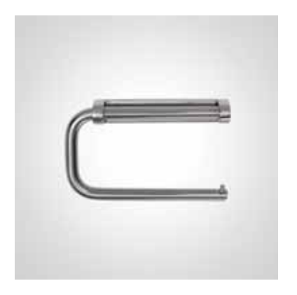
BC271-1 DOLPHIN STAINLESS STEEL TOILET ROLL HOLDER

93 MM HEIGHT 147 MM WIDTH 23 MM PROJECTION