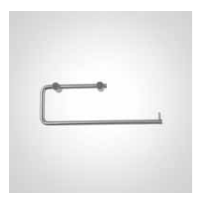
BC270-2 DOLPHIN STAINLESS STEEL TOILET ROLL HOLDER

90 MM HEIGHT I50 MM WIDTH 40 MM PROJECTION