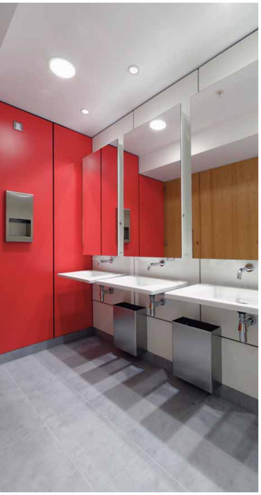
FOR FULL TECHNICAL DETAILS SEE DOLPHINSOLUTIONS.CO.UK