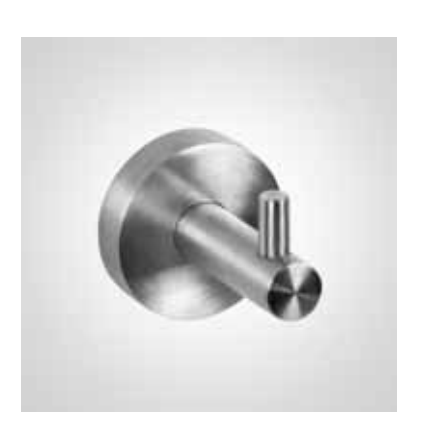
BC725 DOLPHIN SINGLE ROBE HOOK