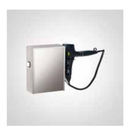
BC109-SDB DOLPHIN BUTTON OPERATED STYLER HAIR DRYER

290 MM HEIGHT 200 MM WIDTH 90 MM PROJECTION