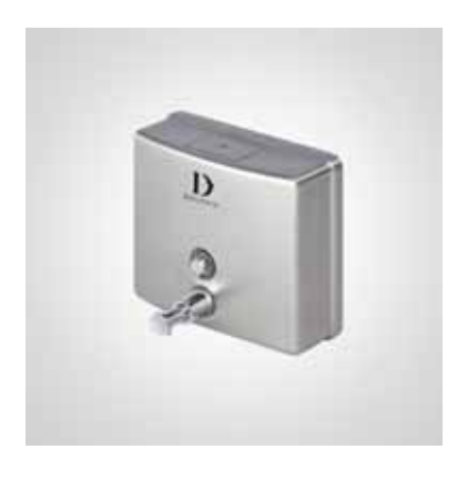
BC713 DOLPHIN STAINLESS STEEL SOAP DISPENSER

I58 MM HEIGHT I78 MM WIDTH 67 MM PROJECTION