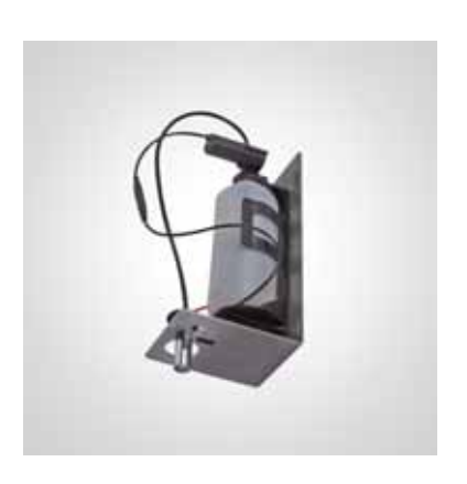
BC634 DOLPHIN BEHIND MIRROR SOAP DISPENSER

320 MM HEIGHT 140 MM WIDTH 120 MM PROJECTION