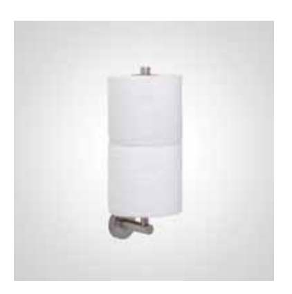
BC722 DOLPHIN SPARE TOILET ROLL HOLDER

230 MM HEIGHT 85 MM WIDTH 97.5 MM PROJECTION