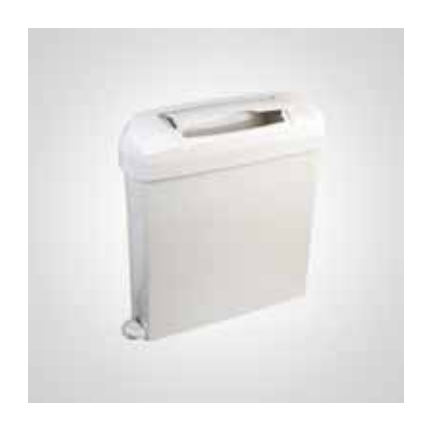
BC981 DOLPHIN PLASTIC SANTIARY BIN

540 MM HEIGHT 490 MM WIDTH 145 MM PROJECTION