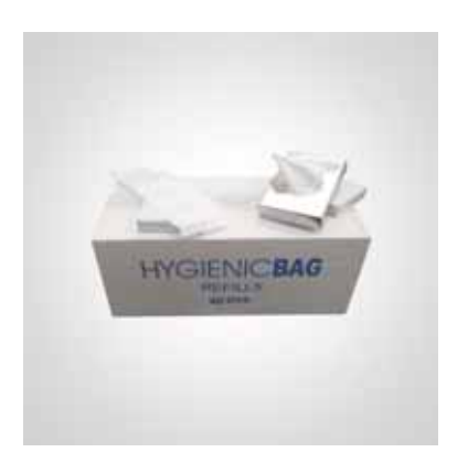
BC288A DOLPHIN SANIBAG BOXES