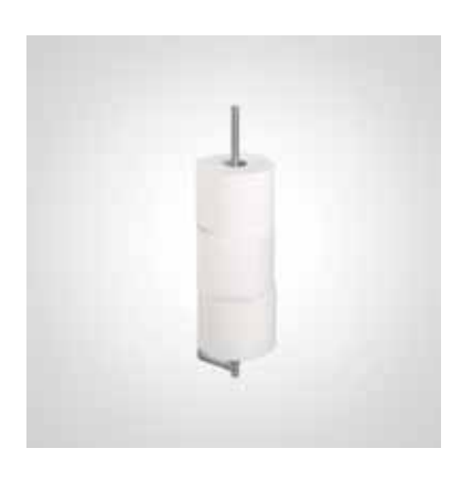
DH437SS DOLPHIN WALL MOUNTED SPARE TOILET ROLL HOLDER