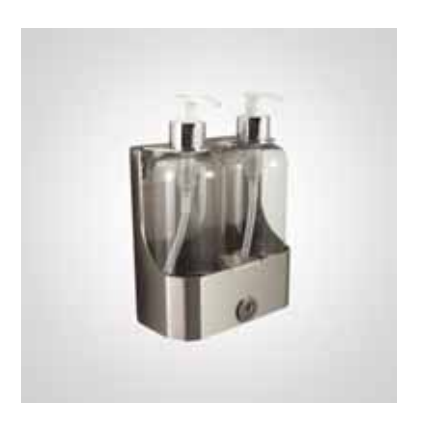
BC362-2 DOLPHIN STAINLESS STEEL SOAP BOTTLE HOLDER

I46 MM HEIGHT I34 MM WIDTH 63 MM PROJECTION