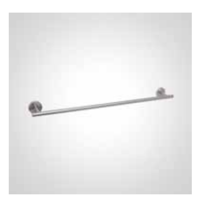
BC728 DOLPHIN TOWEL RAIL