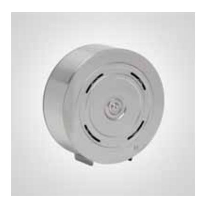
BC936M DOLPHIN DOLPHIN STAINLESS STEEL FOUR ROLL TOILET ROLL HOLDER