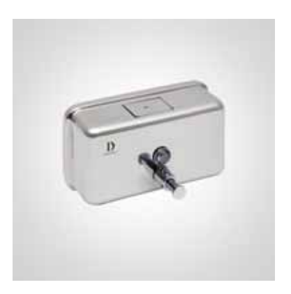
BC913 DOLPHIN SATIN STAINLESS STEEL HORIZONTAL SOAP DISPENSER

121 MM HEIGHT 206 MM WIDTH 72 MM PROJECTION