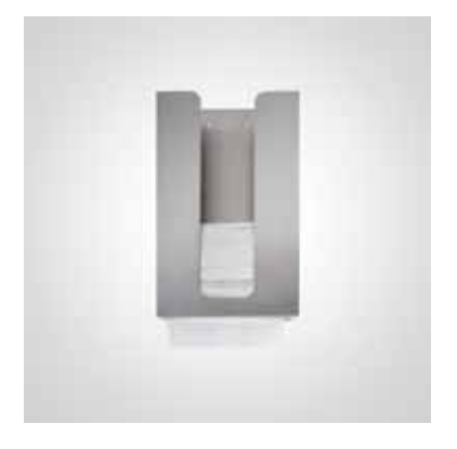
BC9289 DOLPHIN PAPER TOWEL DISPENSER – BEHIND MIRROR / SURFACE MOUNTED

440 MM HEIGHT 268 MM WIDTH 115 MM PROJECTION