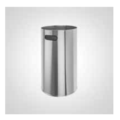
BC140 DOLPHIN STAINLESS STEEL ROUND BIN WITH CASTORS