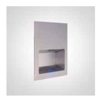
BC27-2SCA DOLPHIN ECO SLIMLINE RECESSED HAND DRYER

400 MM HEIGHT 320 MM WIDTH 10 MM PROJECTION