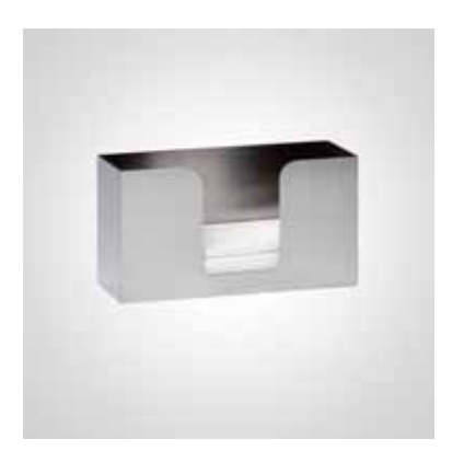
BC919 DOLPHIN PAPER TOWEL DISPENSER

152 MM HEIGHT 279 MM WIDTH 100 MM PROJECTION