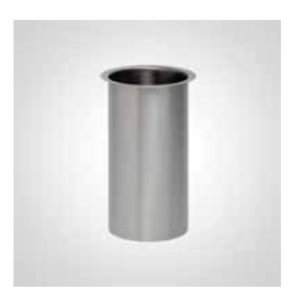
BC915 DOLPHIN BIN RING