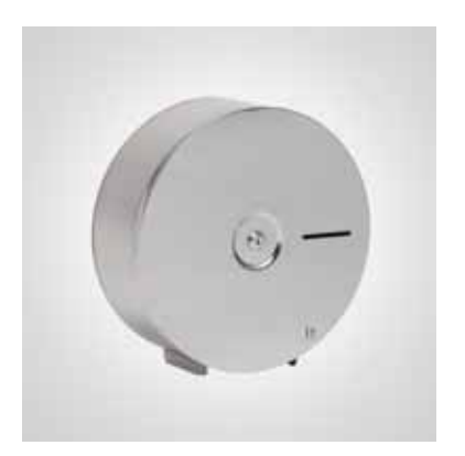
BC936 DOLPHIN STAINLESS STEEL JUMBO ROLL DISPENSER