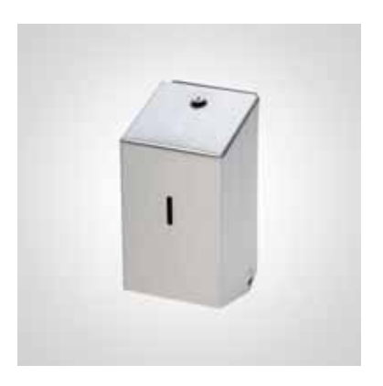
BC850 DOLPHIN TOILET ROLL HOLDER (SPECIAL ROLL TYPE)

272 MM HEIGHT 135 MM WIDTH 155 MM PROJECTION