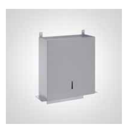
BC9288 DOLPHIN MIRROR PAPER TOWEL DISPENSER

358 MM HEIGHT 298 MM WIDTH 120 MM PROJECTION