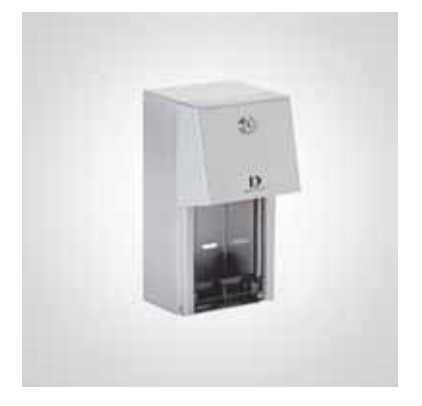
BC800 DOLPHIN STAINLESS STEEL TOILET ROLL HOLDER

305 MM HEIGHT 147 MM WIDTH 165 MM PROJECTION