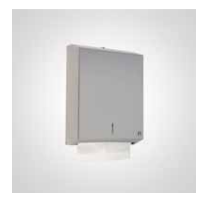
BC928 DOLPHIN STEEL MAXI PAPER TOWEL DISPENSER

370 MM HEIGHT 280 MM WIDTH 103 MM PROJECTION