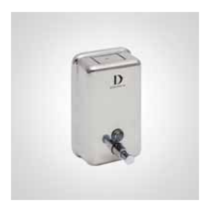
BC923 DOLPHIN STAINLESS STEEL VERTICAL SOAP DISPENSER

206 MM HEIGHT 121 MM WIDTH 72 MM PROJECTION