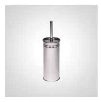
BC426 DOLPHIN STAINLESS STEEL TOILET BRUSH SET