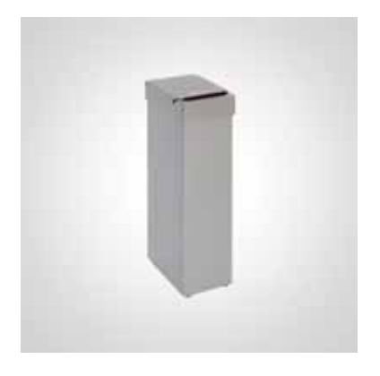
BC980 DOLPHIN STAINLESS STEEL SANITARY BIN

600 MM HEIGHT 169 MM WIDTH 250 MM PROJECTION