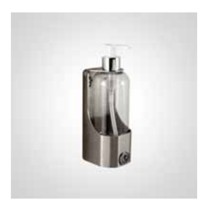
BC362-I DOLPHIN STAINLESS STEEL SOAP BOTTLE HOLDER

147 MM HEIGHT 62 MM WIDTH 62 MM PROJECTION