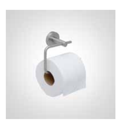
BC721 DOLPHIN TOILET ROLL HOLDER

IO8 MM HEIGHT I50 MM WIDTH 66 MM PROJECTION