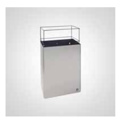
BC920-I DOLPHIN WIRE BASKED FRAME

540 MM HEIGHT 400 MM WIDTH 300 MM PROJECTION