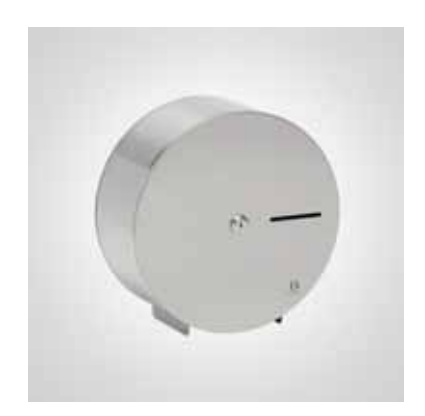
BC925 DOLPHIN STAINLESS STEEL MINI JUMBO DISPENSER