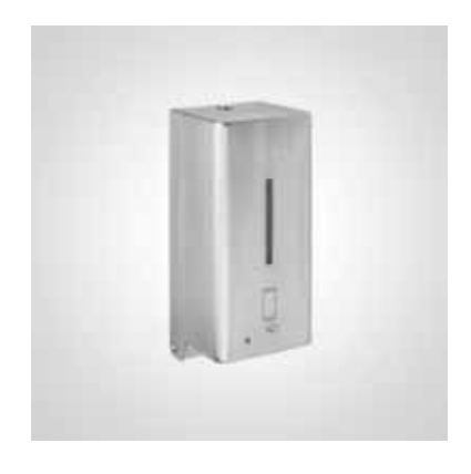
BC950F DOLPHIN INFRARED AUTOMATIC HANDS FREE FOAMING SOAP DISPENSER

267 MM HEIGHT 108 MM WIDTH 107 MM PROJECTION