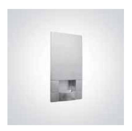
BC30SCA DOLPHIN WASH STATION

815 MM HEIGHT 422 MM WIDTH 74 MM PROJECTION