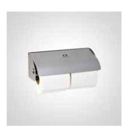
BC267 DOLPHIN DOUBLE STAINLESS STEEL LOCKABLE TOILET PAPER DISPENSER

270 MM HEIGHT 104 MM WIDTH 100 MM PROJECTION