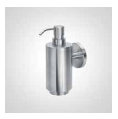
BC9416 DOLPHIN STAINLESS STEEL SOAP DISPENSER