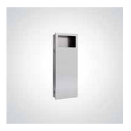
BC27-ISCA DOLPHIN RECESSED PAPER TOWEL DISPENSER

900 MM HEIGHT 320 MM WIDTH 16 MM PROJECTION