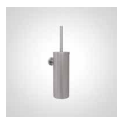
BC727 DOLPHIN TOILET BRUSH SET