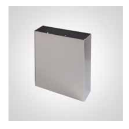
BC921 DOLPHIN STAINLESS STEEL SURFACE MOUNTED BIN

440 MM HEIGHT 360 MM WIDTH 155 MM PROJECTION