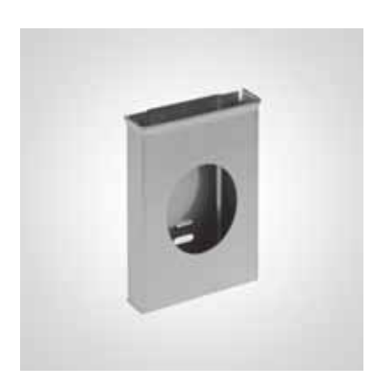
BC278 DOLPHIN STAINLESS STEEL SANITARY BAG DISPENSER

136 MM HEIGHT 92 MM WIDTH 24 MM PROJECTION