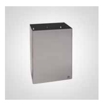
BC920 DOLPHIN STAINLESS STEEL SURFACE MOUNTED BIN

560 MM HEIGHT 405 MM WIDTH 305 MM PROJECTION