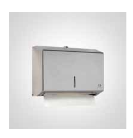
BC918 DOLPHIN STAINLESS STEEL MINI PAPER TOWEL DISPENSER

203 MM HEIGHT 280 MM WIDTH 102 MM PROJECTION