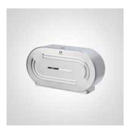
BC945 DOLPHIN STAINLESS STEEL DOUBLE MINI JUMBO DISPENSER

520 MM HEIGHT 290 MM WIDTH 150 MM PROJECTION