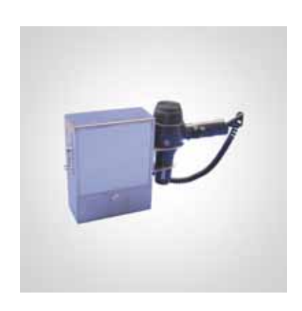
BC109-SDC DOLPHIN COIN OPERATED STYLER HAIR DRYER

290 MM HEIGHT 200 MM WIDTH 90 MM PROJECTION