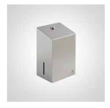
BC4302 DOLPHIN STAINLESS STEEL BULK PACK TOILET TISSUE DISPENSER

224 MM HEIGHT 133 MM WIDTH 144 MM PROJECTION