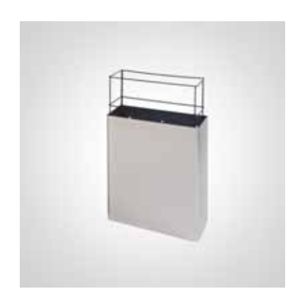
BC921-1 DOLPHIN WIRE BASKET FRAME

420 MM HEIGHT 355 MM WIDTH 150 MM PROJECTION