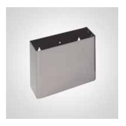
BC922 DOLPHIN STAINLESS STEEL SURFACE MOUNTED BIN

230 MM HEIGHT 275 MM WIDTH 130 MM PROJECTION