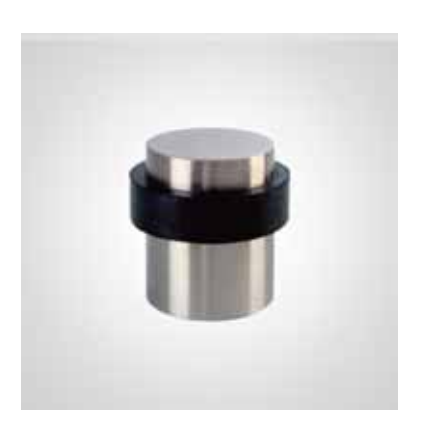
BC404 DOLPHIN FLOOR MOUNTED DOOR STOP

High quality satin stainless steel coat hook