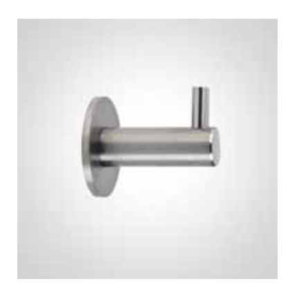
BC402 DOLPHIN STAINLESS STEEL COAT HOOK