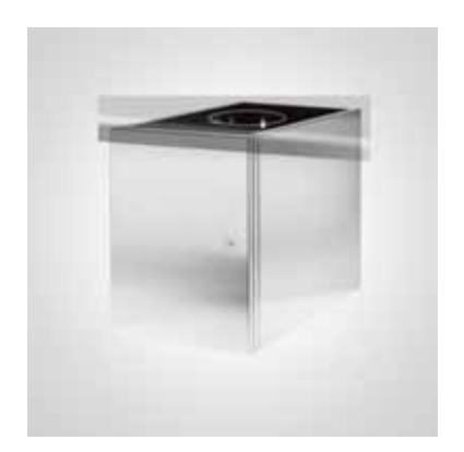
BC170 DOLPHIN STAINLESS STEEL UNDER COUNTER BIN WITH LOCKING DOOR

450 MM HEIGHT 298 MM WIDTH 516 MM PROJECTION