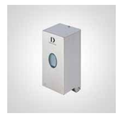
BC950 DOLPHIN INFRARED AUTOMATIC HANDS FREE SOAP DISPENSER

265 MM HEIGHT 110 MM WIDTH 115 MM PROJECTION