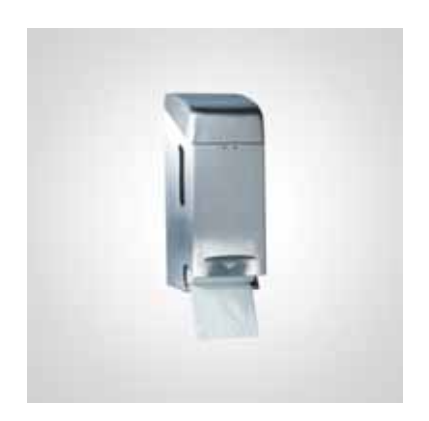
BC707-2SS DOLPHIN TWO-ROLL TOILET ROLL HOLDER

290 MM HEIGHT II6 MM WIDTH I30 MM PROJECTION