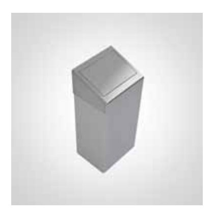
BC150 DOLPHIN STAINLESS STEEL 50 LITRE BIN

707 MM HEIGHT 335 MM WIDTH 258 MM PROJECTION