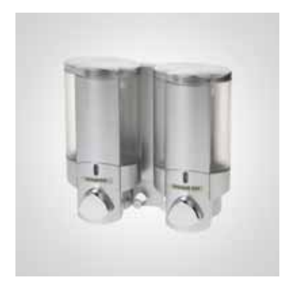
BC624-2 DOLPHIN SOAP DISPENSER

180 mm HEIGHT 185 mm WIDTH 85 mm PROJECTION