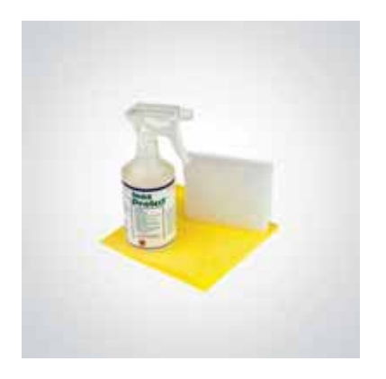
BC148 DOLPHIN STAINLESS STEEL CLEANING KIT