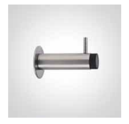
BC403 DOLPHIN STAINLESS STEEL COAT HOOK/ DOOR STOP