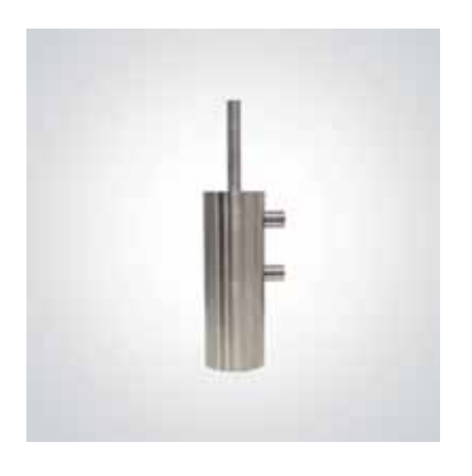
BC9831 / BC9832 DOLPHIN TOILET BRUSH SET