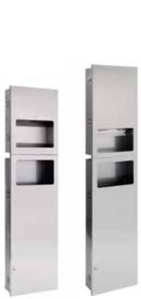
BC27-2SCA with BC27-ISCA