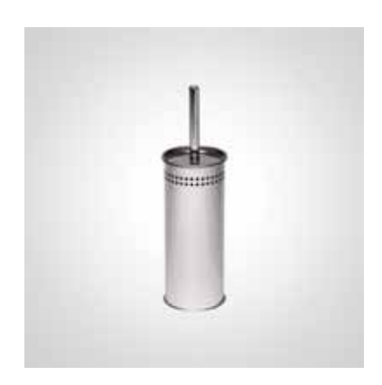
BC427 DOLPHIN STAINLESS STEEL TOILET BRUSH SET