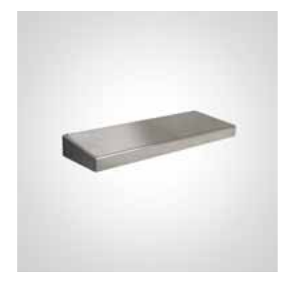
BC750 / BC751 DOLPHIN STAINLESS STEEL SHELF