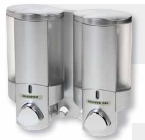
BC 624-2 Double unit