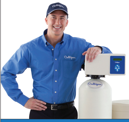
Highly skilled Culligan engineers are always on call, ready to assist you with all your technical problems

• Removing just 1mm of scale can reduce heating bills by at least 10%