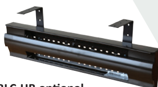
BLC-HB optional suspension brackets for BLC range

BLC-FB Floor Mounting Brackets - For use where pews do not have a conventional back-board