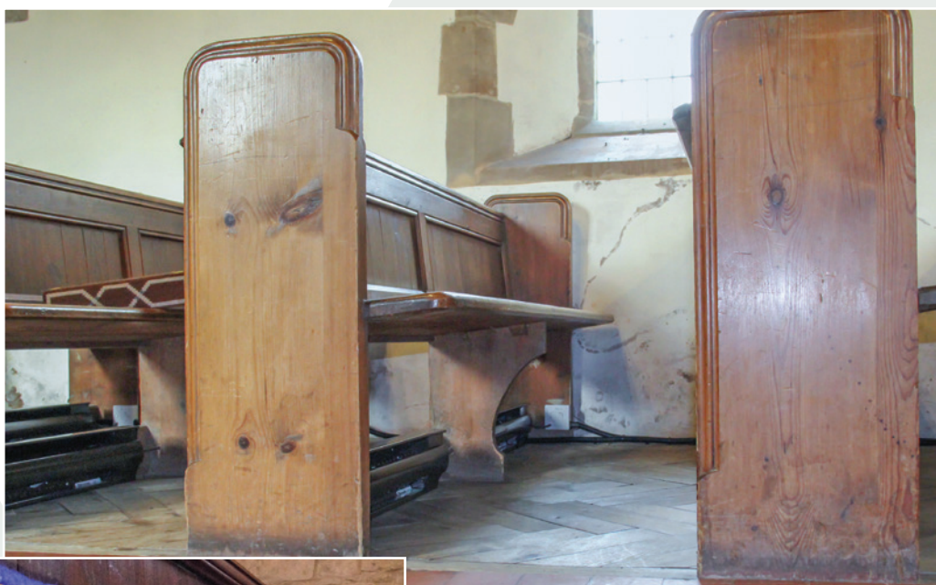
Pew heaters installed in a Worcestershire church