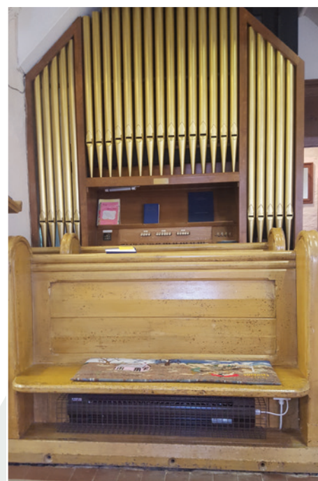
BLC with guard installed under a choir stall in a Somerset church