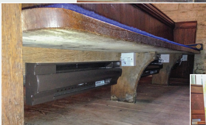
BLC heaters installed under pews in St Bartholomew's Church Notgrove