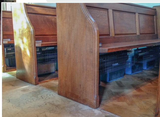
Pew heaters with suspension brackets and guards