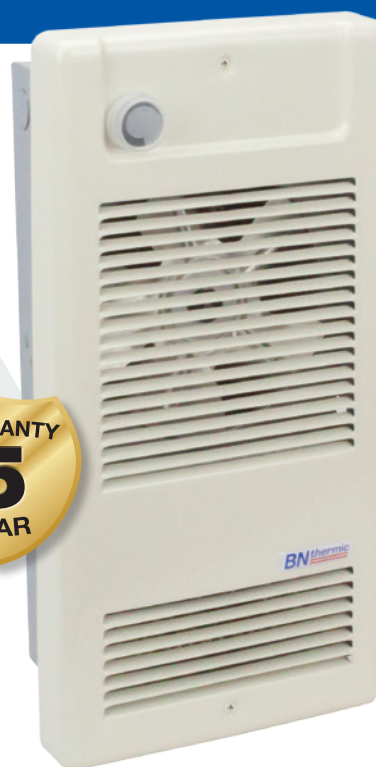
WHE with optional adjustable thermostat