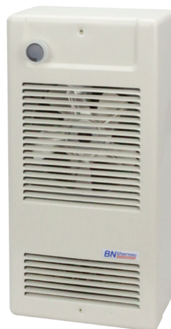
WHE fitted into surface mount box