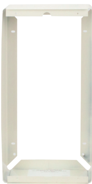
Optional surface mount box