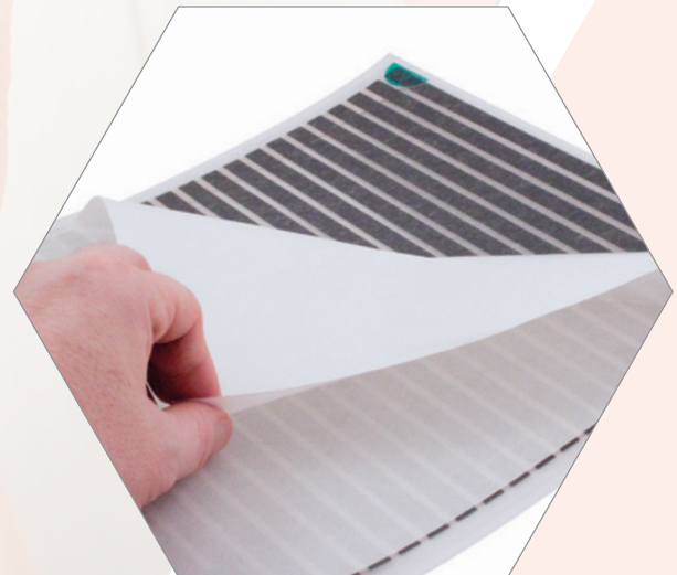
Peel-off adhesive backing