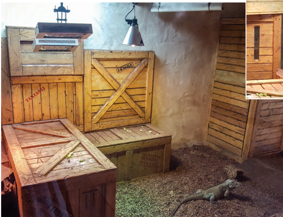
Spot the Iguana!