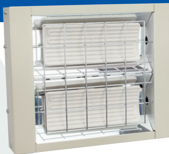
CH-3000 3kW Ceramic Heater providing directional radiant heat without light output