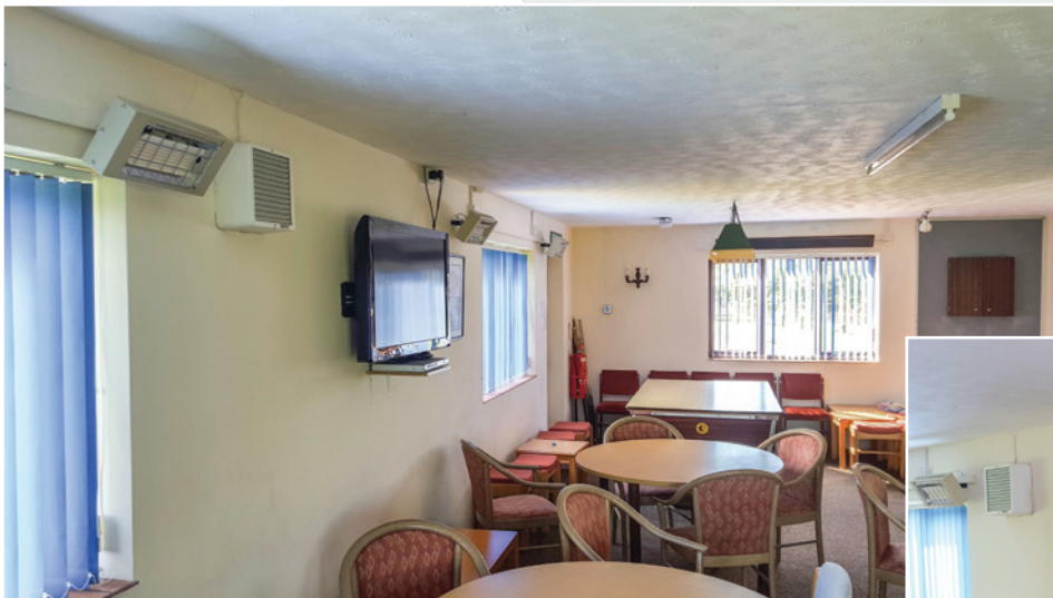
Ceramic heaters provide economic heating in a social club