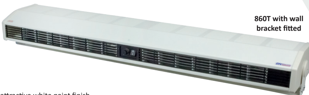
860T with wall bracket fitted