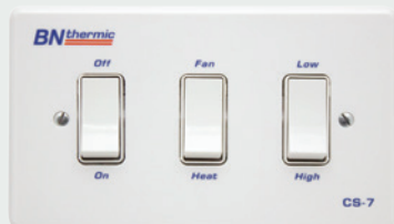
CS-7 switch for high/low/fan only settings