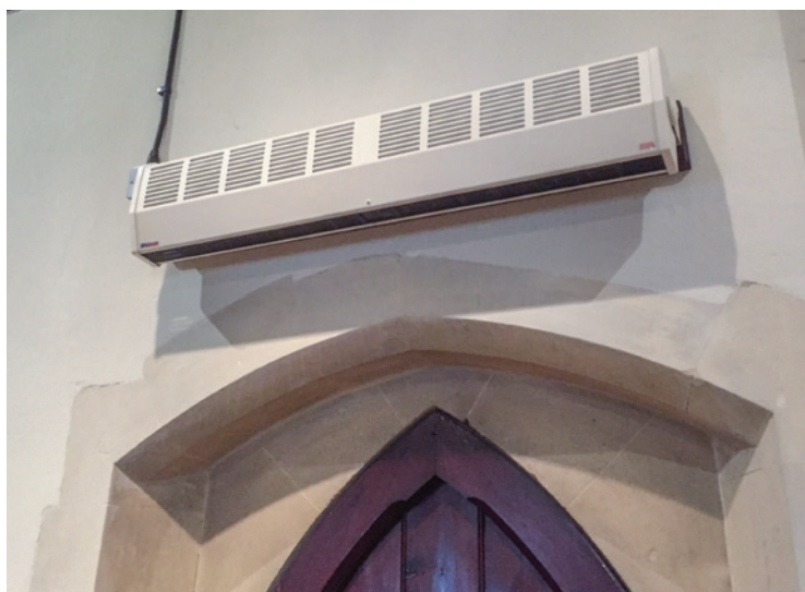
6kW heater combatting draughts in a Hampshire church

FOR MULTI-HEATER SYSTEMS WE RECOMMEND OUR SYSTEM X - See PAGE 26