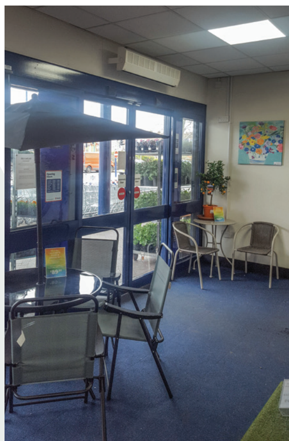
6kW heater over automatic doors in a DIY store