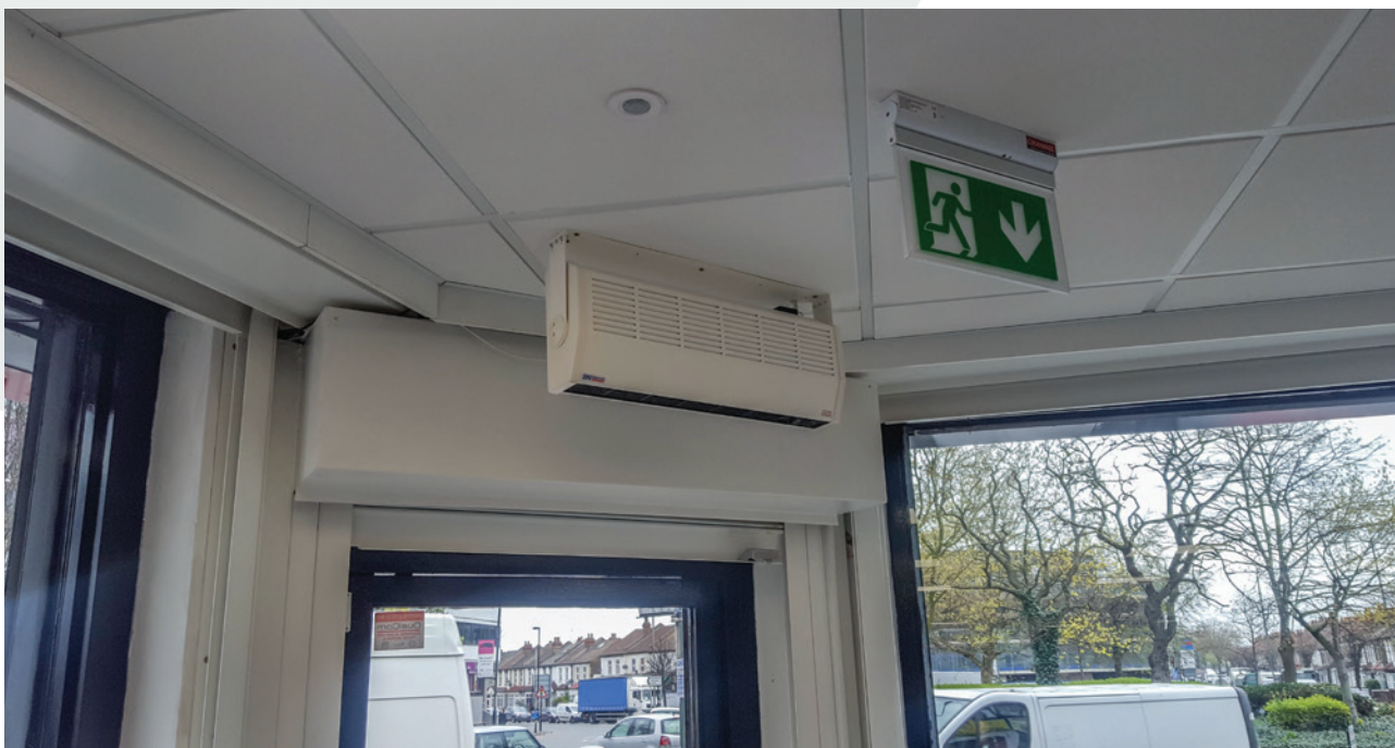
3kW heater providing a warm welcome to customers