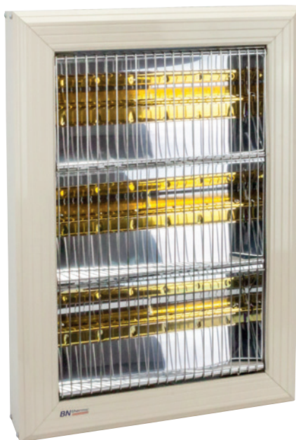
HN2-4500G or HN2-6000G Halogen Heater