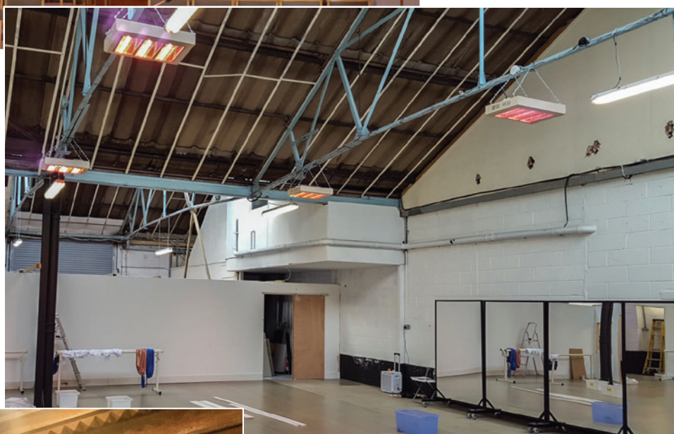
Four 6kW halogen heaters installed in a dance studio