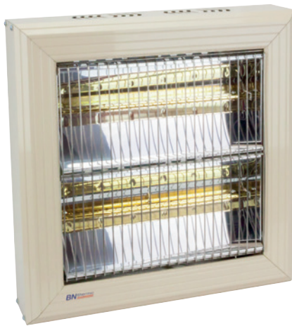
HN2-3000G Halogen Heater