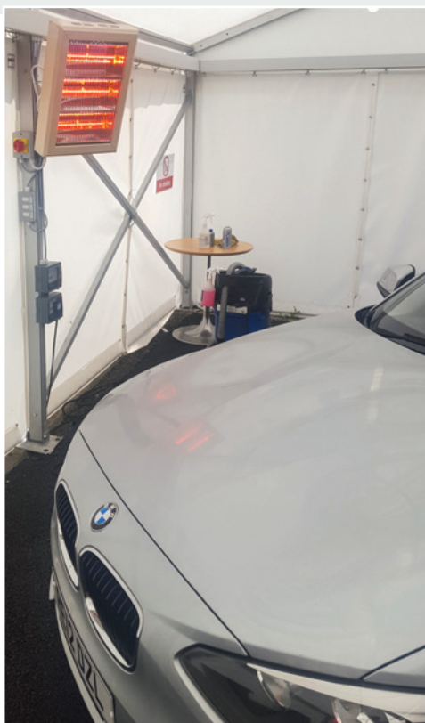
4.5kW Halogen Heater providing instant controllable heat in a car valeting tent