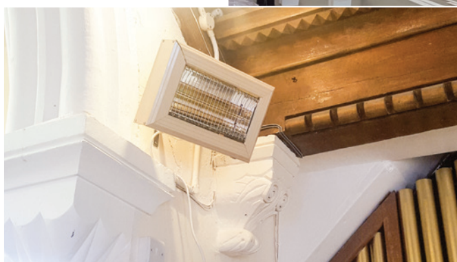
HN Halogen Heater heating the chancel in a Somerset Church