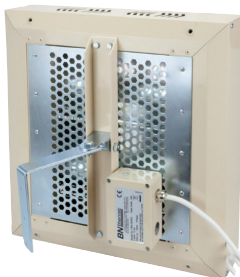
Rear view of HN2-3000G showing wall bracket and terminal enclosure