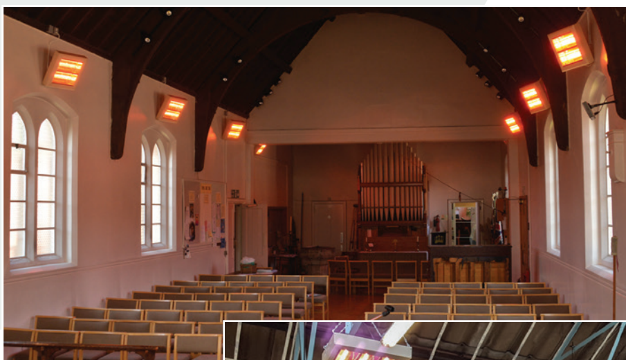
HN2-3000G shortwave heaters providing instant economical heating in St Stephen's Church Barnet