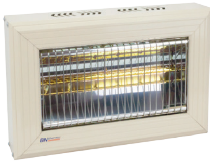
HN2-1500G or HN2-200G Halogen Heater