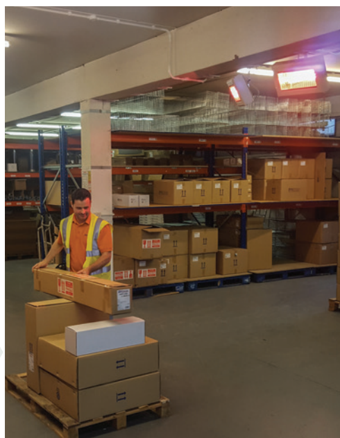
2kW halogen heaters 'spot heating' a packing area in a warehouse