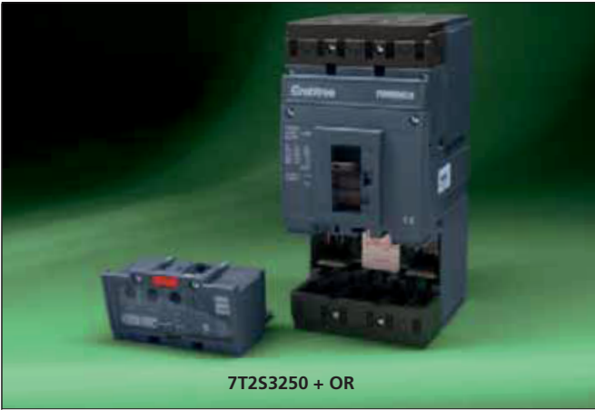
7T2S3250 + OR