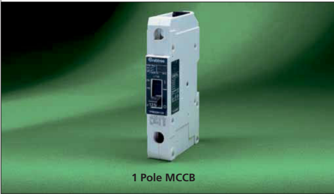
1 Pole MCCB