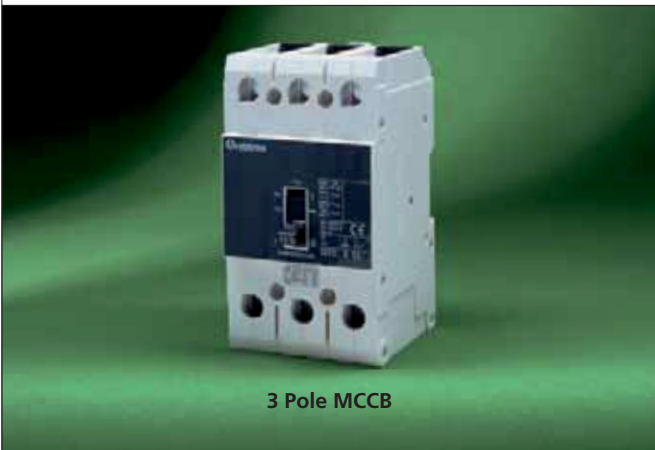
3 Pole MCCB