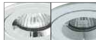
50W GU10 Halogen