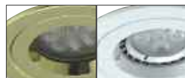
Up to 14W GU10 CFL