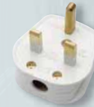
PA380WH Non-standard plug