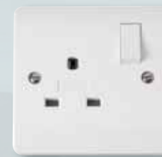
CMA935 Non-standard socket