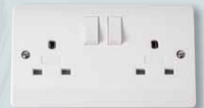
CMA936 Non-standard socket