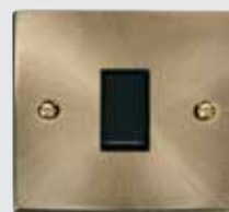
011 (025 intermediate)