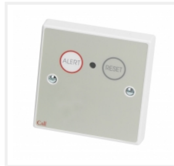
Emergency Only Call Point, Button Reset