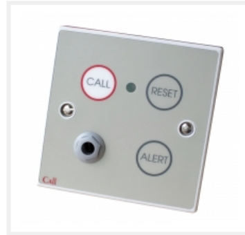
Emergency Call Point, Button Reset c/w Remote...