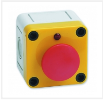
Water Resistant Alert Point, IP65, Magnetic Reset