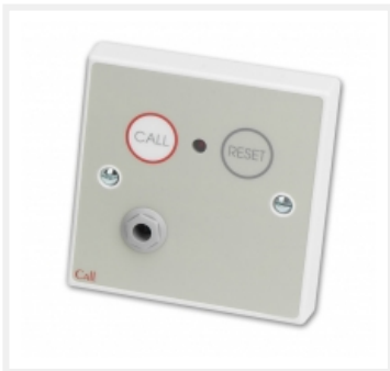
Emergency Infrared Call Point, Button Reset c/w...