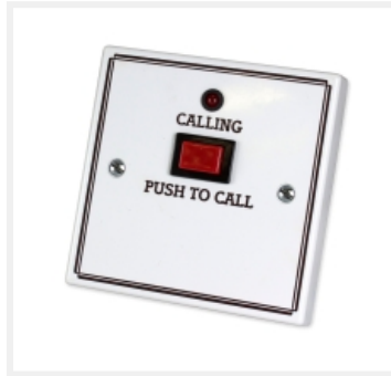
Standard Call Push with Protruding Button, No...